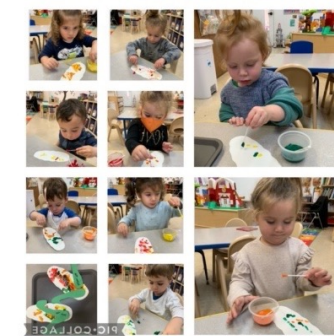
Devorim Class (Twos)