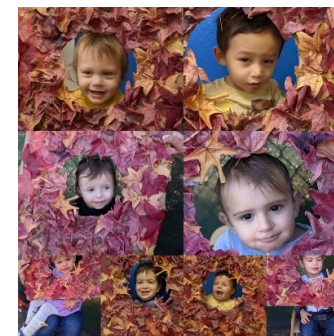
Kochavim Class (Ones)