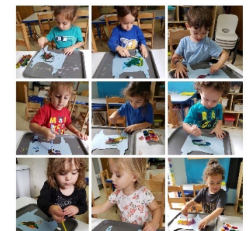
Parparim Class (Transition)