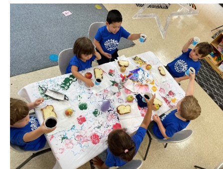
Prachim Class (Threes)