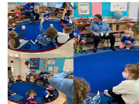
Haverim Class (Pre-K)